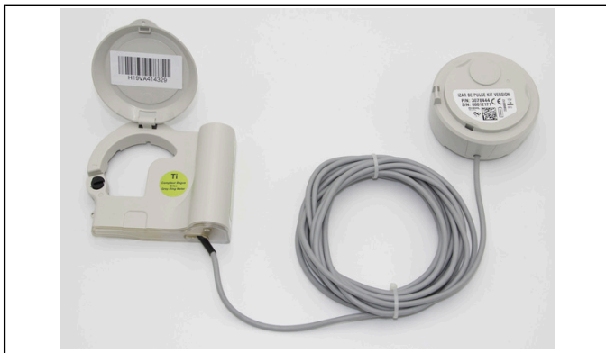
Kit IZAR BE PULSE + IZAR PULSE i

IZAR BE PULSE is also available as a factory-assembled kit with an IZAR PULSE i. The cable length can then vary between 4.95 and 5 meters due to the manufacturing tolerance. The kit is IP68 and can be submerged.