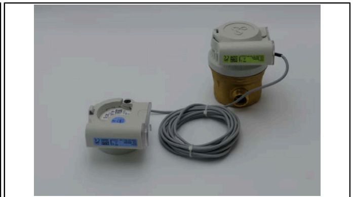
Kit IZAR BE PULSE + IZAR PULSE i + ALTAIR V4 + IZAR RC i