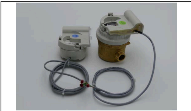
IZAR BE PULSE + IZAR RC i + ALTAIR V4 + IZAR PULSE i